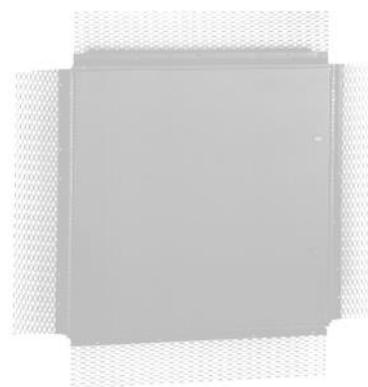
TME With 3" Expanded Metal

SEVERAL SIZES TMP AVAILABLE FOR 1 DAY SHIPPING FROM SELECTED WAREHOUSES