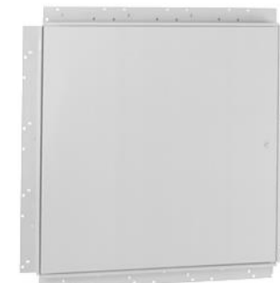
TMP with 3/4" Metal Lath Wings

NEW- REVIT OBJECTS FOR BIM— TMP DOWNLOAD TME DOWNLOAD