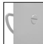
Standard Cam Latch

Model Width Height Lock (C Std or Option Code) Optional Paint TMP TME TMPG TMPs