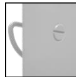
Standard Cam Latch