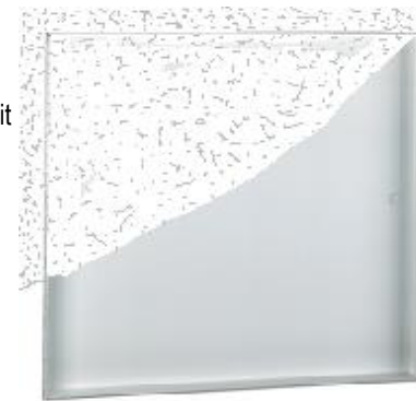
Panel shown as partially-covered by acoustic tile

Sizes: Minimum 8" x 8" (203 x 203 mm), maximum 36"x 36"